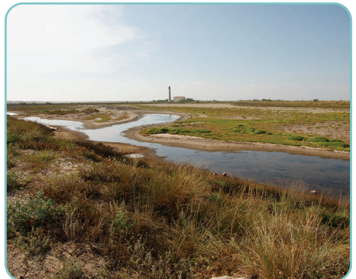
Camargue's Former Saltworks

Two key elements at the 7 th IPBES plenary in Paris will be the Global assessment of biodiversity and ecosystem services, and the new work program. The development of the global report is an amazing achievement, but its results indicate a continued loss of biodiversity and their contribution to people's well-being. Deliverables proposed for the new IPBES working program cover important knowledge gaps, notably the connections between drivers and impacts. However, the policy relevance of the Deliverables could be improved if they would inspire informed action by public, private and civil parties, by including knowledge syntheses on effective actions. Actions such as nature-based solutions provided by wetlands have proven to effectively address drivers and impacts on the current global loss of biodiversity and their contributions to people.