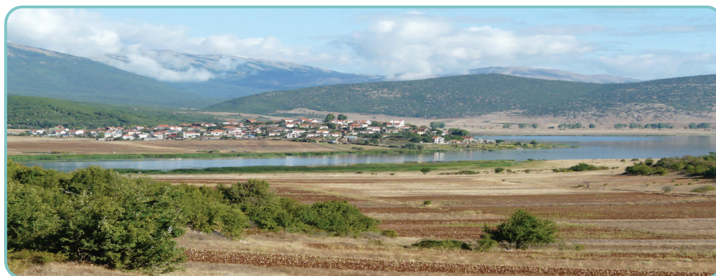
Prespa Lake